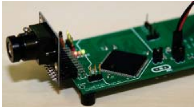
Fig. 3. Photo of an early TrustEYE feasibility study. The custom-designed circuit board carries an STM32F417 ARM Cortex M4 microcontroller (168 MHz, 1 MB Flash, 192 kB SRAM) external SRAM and a camera module. In this feasibility study the connection to the camera host system is established via SPI operating at 32 MHz.

Figure 4 shows a picture of the first assembled prototype of the TrustEYE sensing unit which is currently used for design validation and firmware prototyping tasks. At this early development stage, the camera host system is implemented with a Raspberry Pi 1 evaluation board. The Raspberry Pi is running a standard Linux distribution and is used to deliver data received from the TrustEYE sensing unit via the Ethernet to information consumers. The connection between the TrustEYE prototype system and the Raspberry Pi is implemented via the Serial Peripheral Interconnect (SPI) which is operated at 32 MHz. Data flow is unidirectional from TrustEYE to Raspberry Pi which ensures that the Raspberry Pi camera host system can not randomly access raw data temporarily stored within the TrustEYE sensing unit.